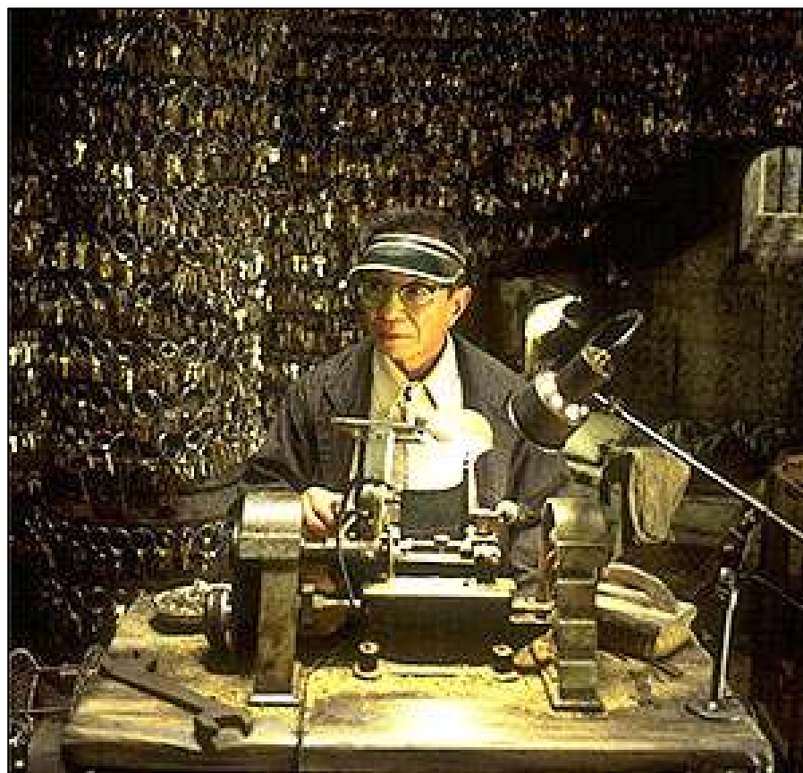
The Keymaker from “The Matrix Reloaded”

He is able to make keys that get him into secret areas of the Matrix.